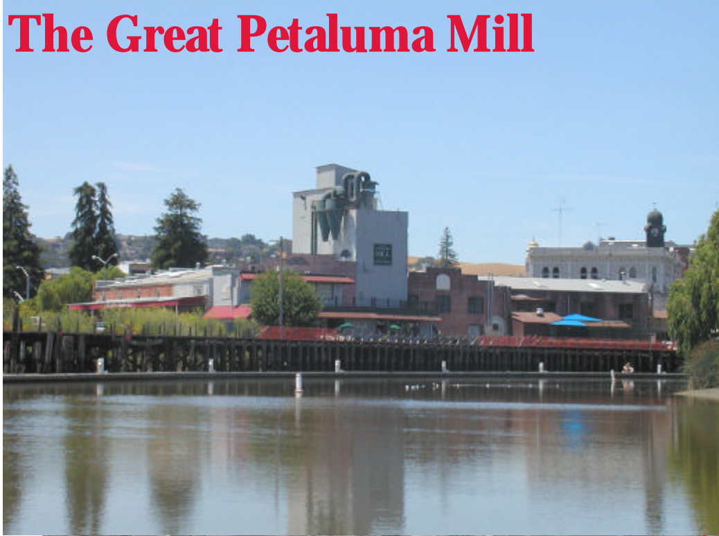
The Great Petaluma Mill