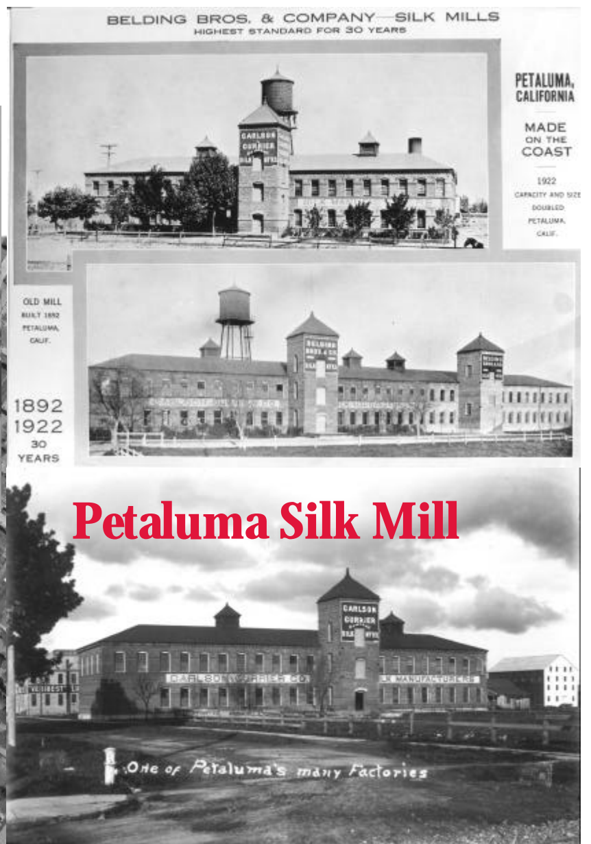
Petaluma Silk Mill