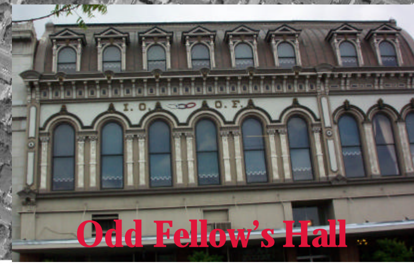
Odd Fellow's Hall